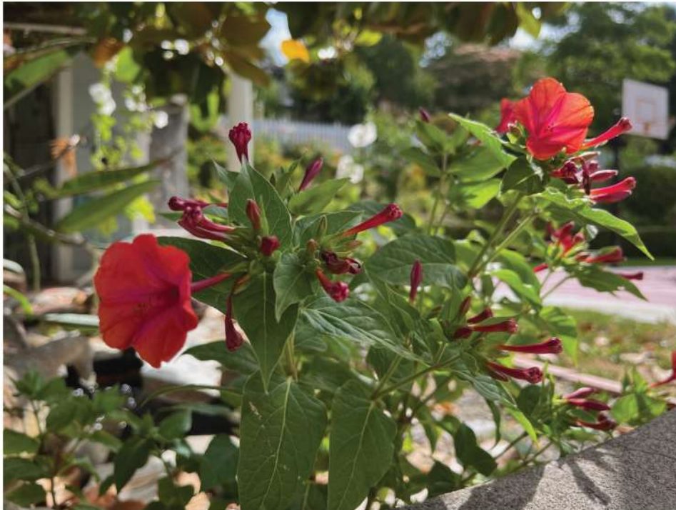
Four O'clock flowers usually open in the afternoon and bloom throughout the night.