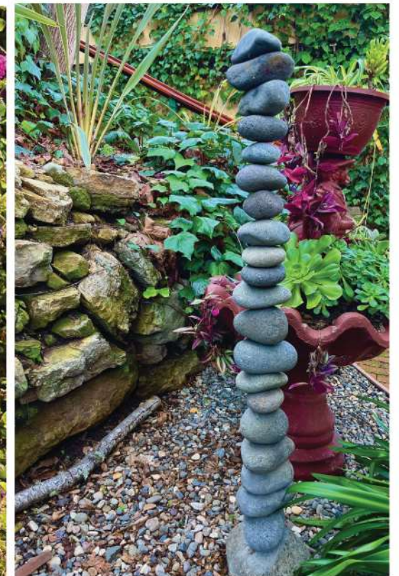
Build a rock cairn for fun or as a monument.

“What good is the warmth of summer, without the cold of winter to give it sweetness.” John Steinbeck