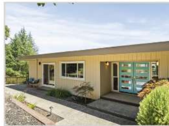
38 El Gavilan, Orinda 5 Bd | 2.5 Ba | 2702 Sqft | $1,725,000

This wonderful 5 bd/ 3 ba mid-century gem offers one level living & space for everyone!