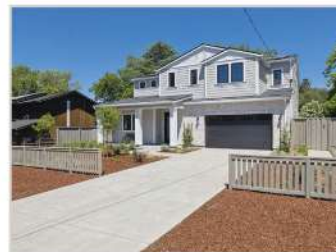
1072 Mountain View Blvd, Walnut Creek 5 Bd | 4.5 Ba | 3486 Sqft | $3,100,000

This contemporary ranch style home features 4 bd/2ba, 2,148 sq ft on a spacious .33 acre double cul-de-sac lot!