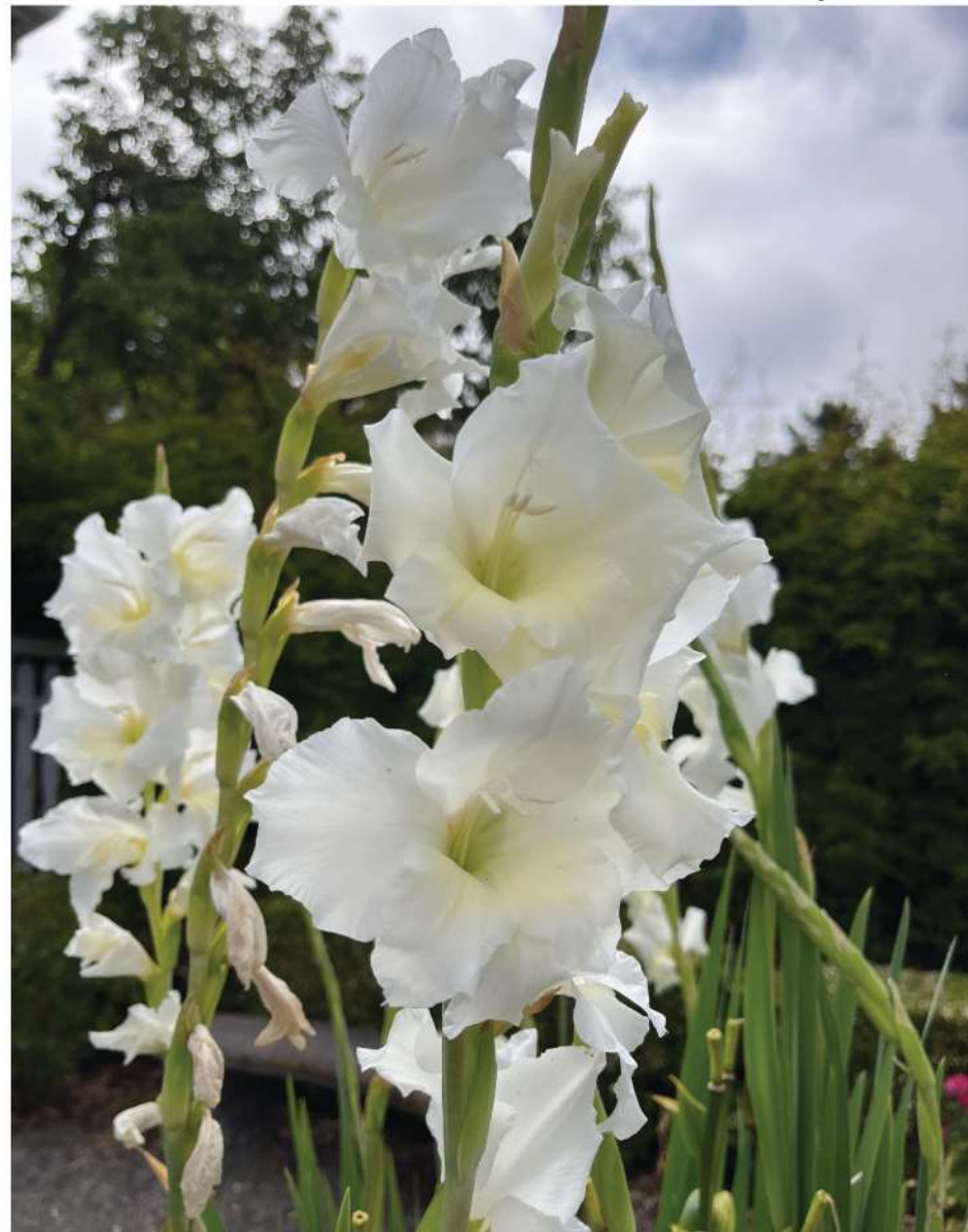
White gladiolus shines in the evening garden.

Add to your summer sweet garden with a rock cairn. Throughout his-