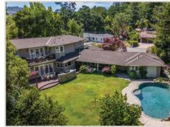
188 Lombardy Lane, Orinda 5 Bd | 4 Ba | 3948 Sqft | $3,495,000

This exquisite home combines luxury, comfort, quality, privacy, & convenience to SF & top tier Orinda schools.