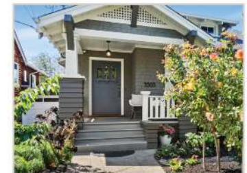
5505 Taft Avenue, Oakland 2 Bd | 1 Ba | 1678 Sqft | $1,295,000

Westside Alamo single story rancher fits 4 bd/ 2 ba, park-like yard & pool on amazing 1/2 acre level lot in ideal location!