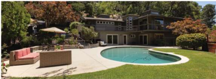
ORINDA | POOL PARTY | 4 VIA CALLADOS SLEEPY HOLLOW | $2,895,000 | 4 BD | OFFICE | 3.5 BA | 3,326 SF | .54 AC