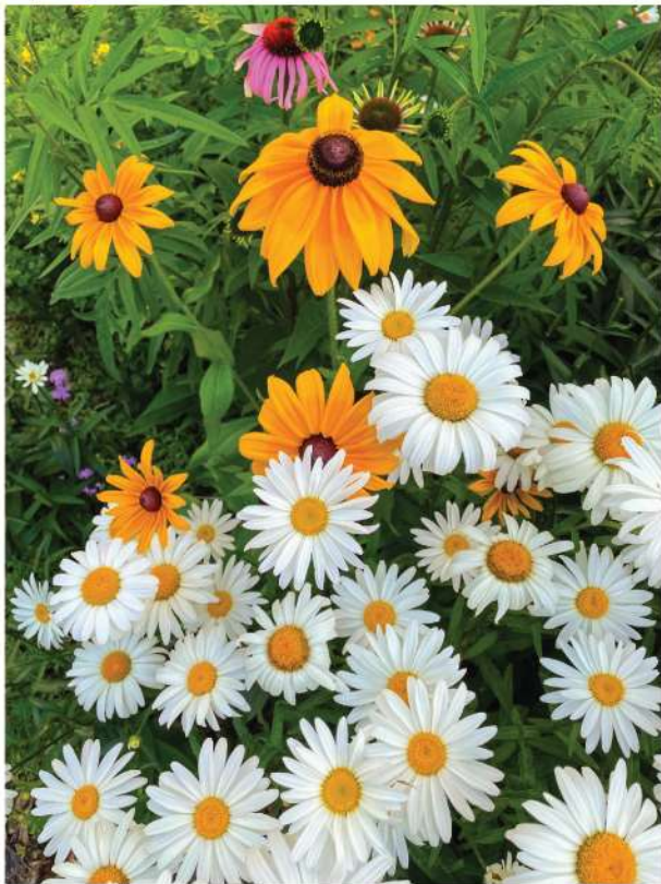
Daisies, rudbeckia, and echinacea enrich the sweetness of summer.