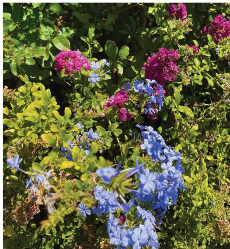
Sky blue plumbago with pink crape myrtle.