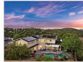
108 Oak Road, Orinda 4 Bd | 3 Ba | 3377 Sqft | $2,995,000

Fabulous home in coveted Sleepy Hollow w/a wonderful floor plan & spectacular private backyard!