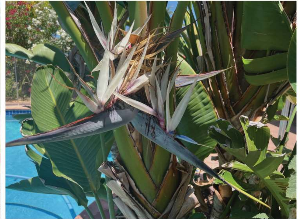
The blue giant bird of paradise, a native of South Africa, exhibits a crown of white sepals with a blue tongue.