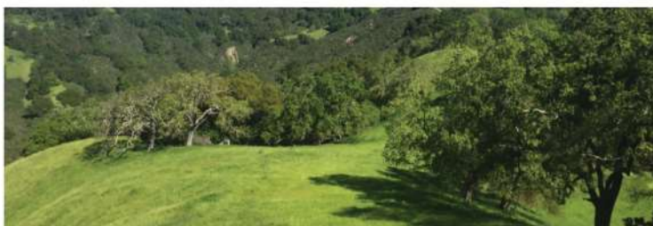
LAFAYETTE | 2 ESTATE LOTS | POPULAR HAPPY VALLEY GLEN 1240 MONTICELLO RD | 15.52 AC | $2,985,000 0 MONTICELLO RD | 7.64 AC $2,398,000