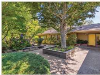
237 Glorietta Blvd, Orinda 5 Bd | 3 Ba | 3109 Sqft | $2,650,000

This home enjoys over 4000 sqft of living w/ an outdoor retreat including a pool & sports court ideal for gatherings and fun in the sun!