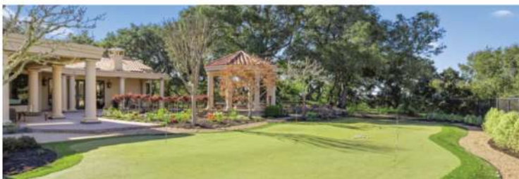
ORINDA | PUTTER'S PARADISE | 10 ORINDA VIEW ROAD $5,585,000 | 4 BD | 5.5 BA | OFFICE | 5,691 SF | 1.17 AC