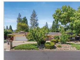
3147 Via Larga, Alamo 4 Bd | 2 Ba | 2188 Sqft | $2,195,000

Incredible opportunity to move into a brand new home in Walnut Heights, one of Walnut Creek's most desirable locations!