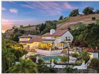
60 Coachwood Terrace, Orinda 7 Bd | 5.5 Ba | 6602 Sqft | $6,995,000

This secluded 7 bd/ 5.5 ba property offers views & a European vibe w/ close to town convenience & excellent schools!