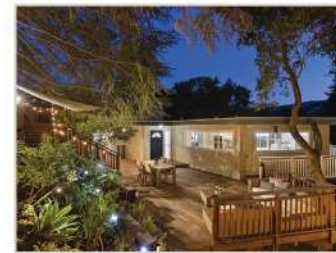
76 La Cuesta Road, Orinda 3 Bd | 2 Ba | 1762 Sqft | $1,575,000

Bright 5 bd/2.5 ba home in Orinda w/ amazing views!