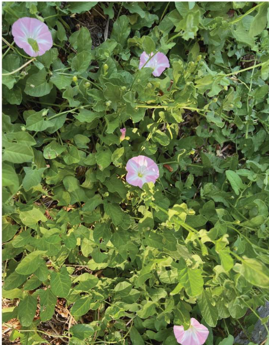
Pink bindweed is pretty yet an invasive, destructive weed.