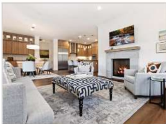
50 Woodbury Highlands #34, Lafayette 3 Bd | 3 Ba | 2143 Sqft | $2,300,000

This expansive 3 bd/ 3 ba home spans 2,685 sf on a generous 0.56-acre lot in the coveted Happy Valley neighborhood.