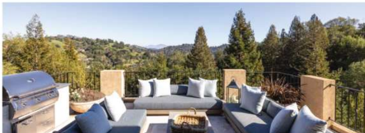
ORINDA | MT. DIABLO VIEWS | 42 TAPPAN LANE SLEEPY HOLLOW NEIGHBORHOOD | $6,895,000 | 5 BD | 6.5 BA OFFICE | 8,096 SF | 2.26 AC