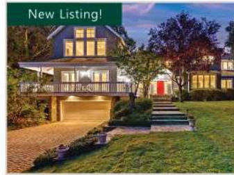
New Listing! 291 Monte Vista Ridge Road, Orinda 5 Bd | 4.5 Ba | 5576 Sqft | $4,250,000

This secluded 7 bd/ 5.5 ba property offers views & a European vibe w/ close to town convenience & excellent schools!