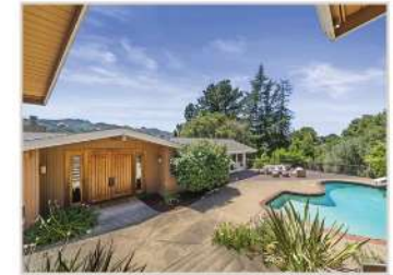
11 Idyll Court, Orinda 6 Bd | 4.5 Ba | 4020 Sqft | $2,795,000

Built in 2000 & nestled in one of Orinda's close to town neighborhoods, this bright spacious home has everything you are looking for!