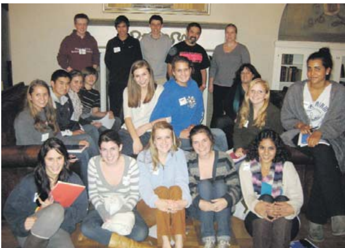
The three Youth Committees met at the Hacienda de las Flores in Moraga